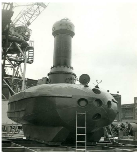
Fig. 3 Geonur 2 at the shipyard.

Several dozen of boreholes were drilled in the Baltic Sea at depths of up to 30 m and 10 - 20 m below the bottom from the Geonur deck, mainly in 1983. The works were secured by the PRO Jantar rescue vessel. Many divers from scuba diving clubs and professional divers, geologists, hydrogeologists, geophysicists and other experts took part in the operation of Geonur 2. Their work was secured by medical doctors from the Central Institute for Labour Protection. The Geonur work was of interest to the Naval Rescue Service as an underwater vehicle was needed for rescue purposes, also for rescuing submarine crews [4,5].