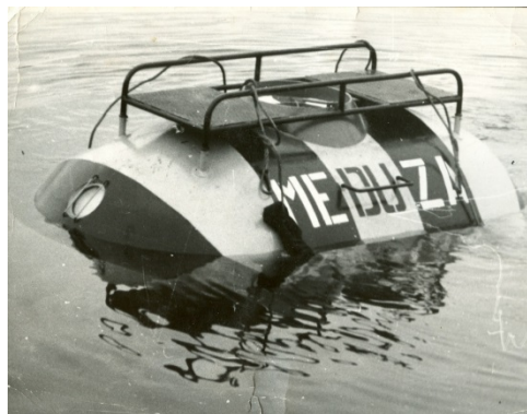
Fig.1 Meduza 2 after modernisation.

Meduza 2 habitat was used in the construction of the Port Północny (Northern Port) in Gdańsk. This project required divers to work at shallow depths of up to 20 m. The work involved taking samples of sediment cores from the bottom and testing the hardness and bearing capacity of the bottom before and after explosion hardening. Meduza 2 also worked for the Geological Institute in Sopot in the Baltic Sea in the depth zone down to 60 m (at the time, this depth was the maximum up to which air could be used as a breathing medium) for bottom sampling aimed at searching for rare minerals [4].